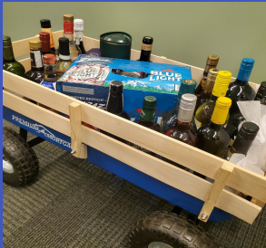
Wagon of Cheer 2020

MP Caroll Hardwood, B & L Wholesale, 84 Lumber, B & D Concrete, Marrano Homes, Essex Homes of WNY, Forbes Capretto Homes, MJ Peterson/Tucker Homes, Natale Builders, Alliance Homes, and David Homes. Also, NAHB, NYSBA, Bulletproof.