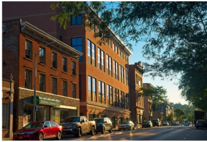
Photo caption: Peekskill Lofts - 82 units of affordable housing located at 645 Main Street in the Peekskill Artist's District bringing economic vitality to Peekskill's downtown while providing places for people to live.

New York State is a Great Place to Live that needs More Places to Live.